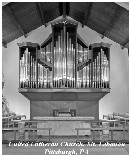
United Lutheran Church, Mt. Lebanon Pittsburgh, PA